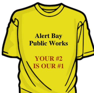
T Shirt Suggestion

Want to know more about what the Public Works Department is responsible for? Just drop us a line.