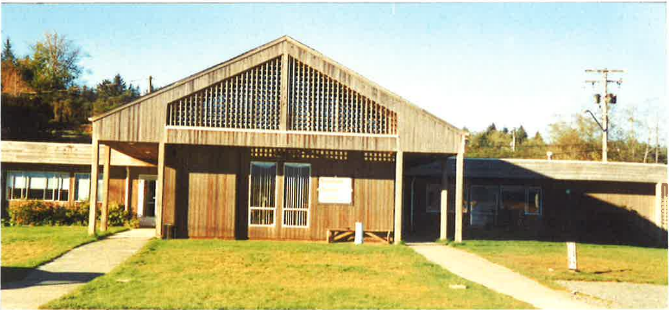
The 'Namgis Health Centre offers a variety of services, some of them include: Doctor's Offices, Dental Clinic, Community Health Nurse, Counseling and much much more.