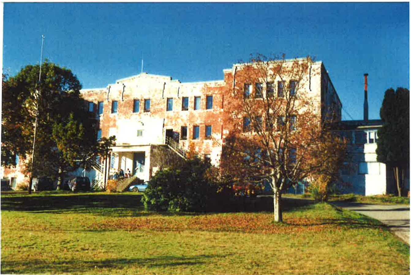
The 'Namgis House formerly the Michael's Residential School was opened in 1929, to educate and house native children from the outlying areas in the region. It was one of the last Residential Schools to close in the early 1970's. The building was used as the 'Namgis First Nation administration office, however they have now moved to a new building. The 'Namgis House take down completed mid April, 2015.