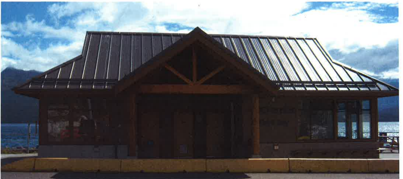
This is the BC Ferry dock and waiting room, opened August 24, 2007, located in the middle of the Bay.