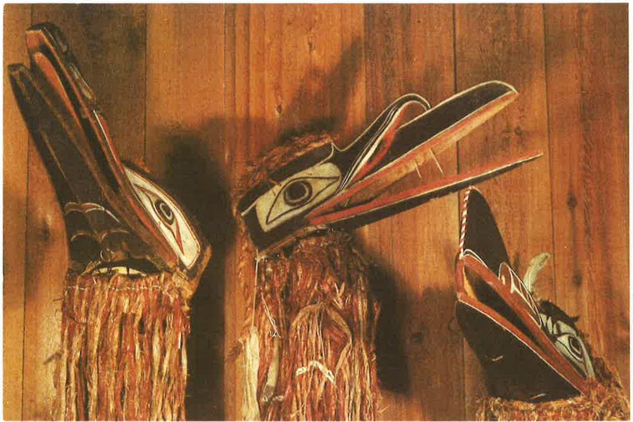
These two postcards depict just a couple of the beautiful artifacts that you will see at the U'mista Cultural Centre.