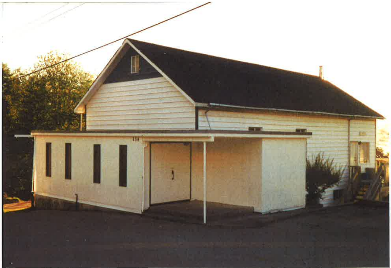
This is our Glad Tidings Pentecostal Church, first service February 2015 after many years of being closed.