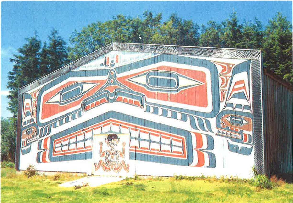
This is our traditional big house. This is where we hold our Potlaches and other important ceremonies. The Big House was lost to fire on August 29, 1997. On May 29, 1999, was the Grand Opening of our new Big House. Post card is now out of print.