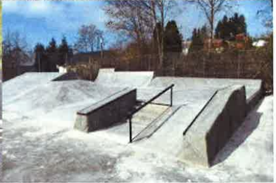
We have two Tennis Courts and a Skate Board Park next to our Community Hall.