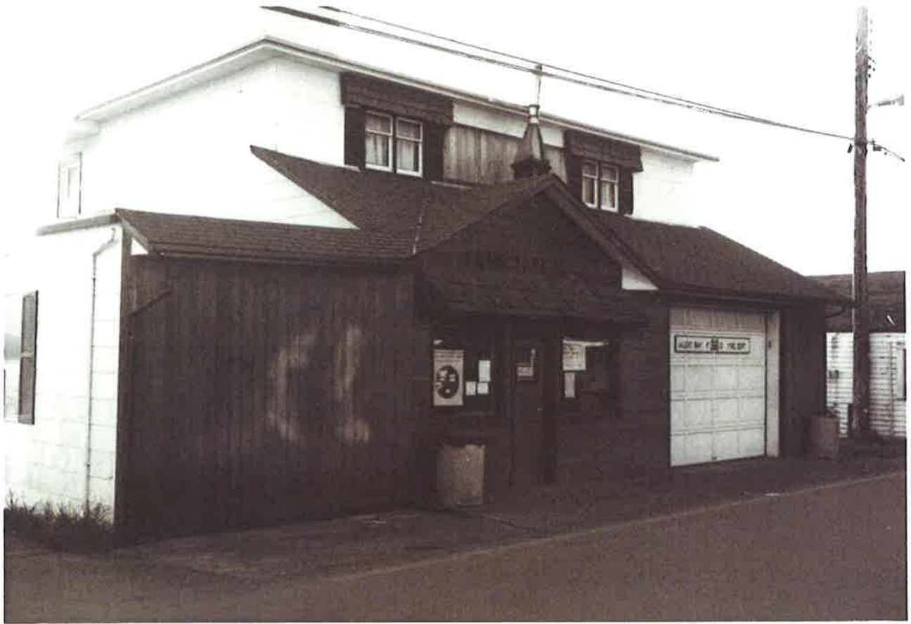
Above is an old picture of the Village of Alert Bay Office and Alert Bay Fire hall. It is now the Alert Bay Visitor, Alert Bay Library-Museum.