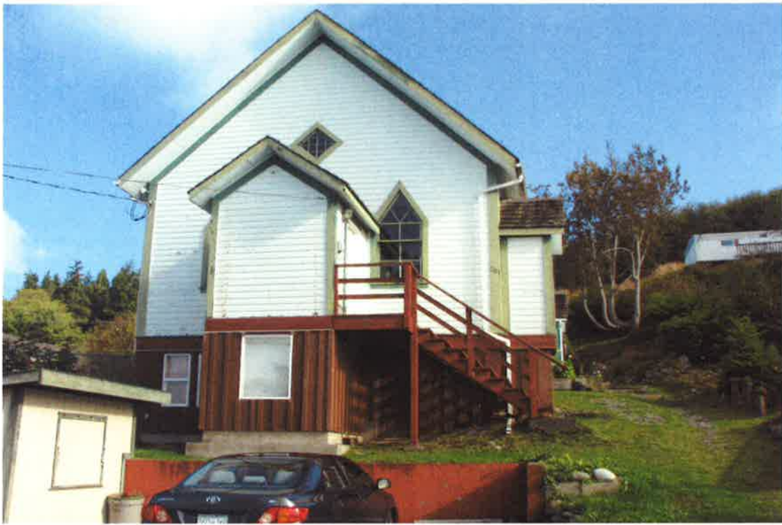
This is the former Methodist Church its structure was built in 1913. The building became the United Church, in 1946 it was taken over by the Pentecostal Mission. It is now a privately owned residence.