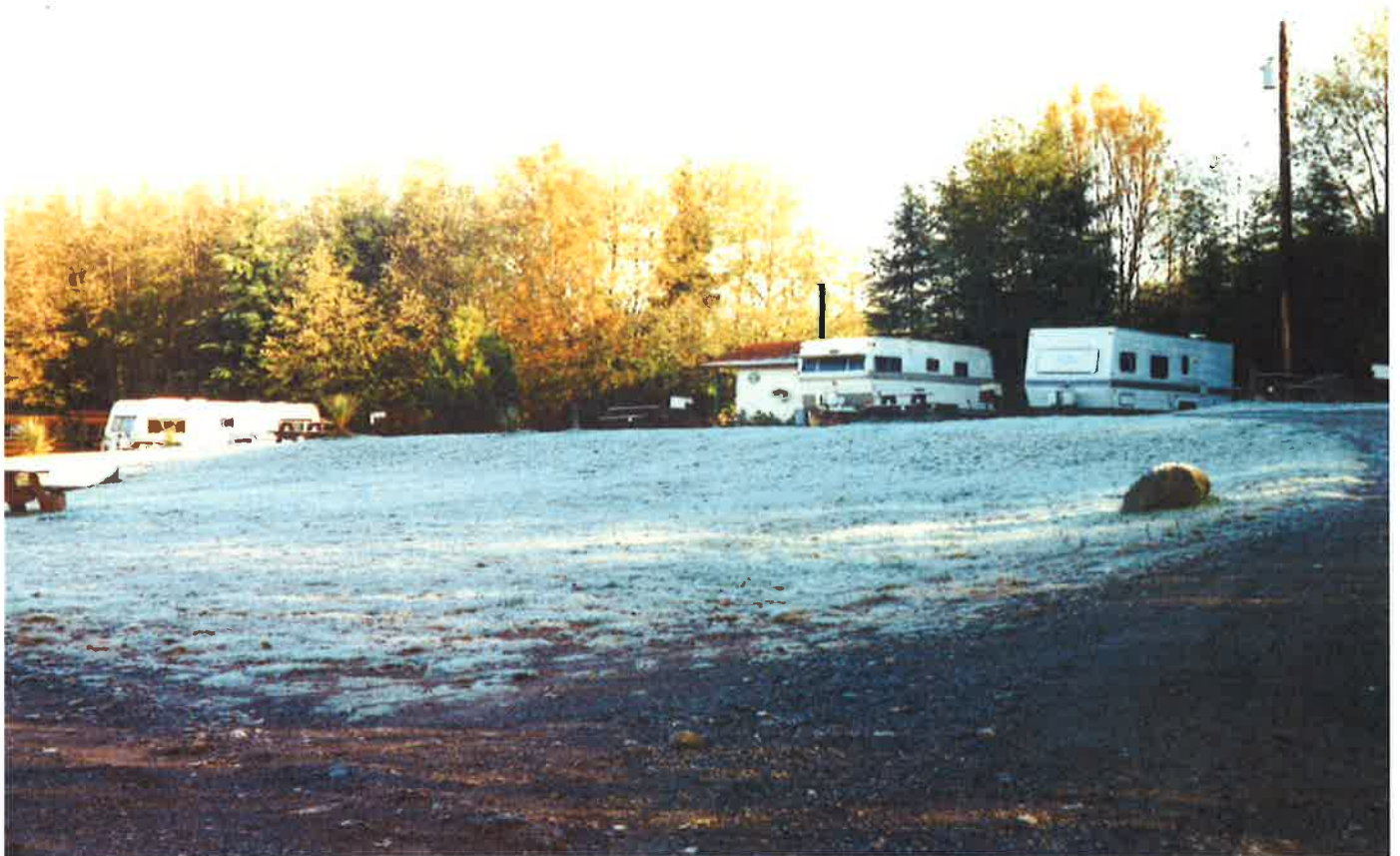
This is the Alert Bay Campground. Seasonal: April to October. It is $22.00 per night for hookups and $13.00 per night for tents. Our campsite is located next to the Ecological Park.