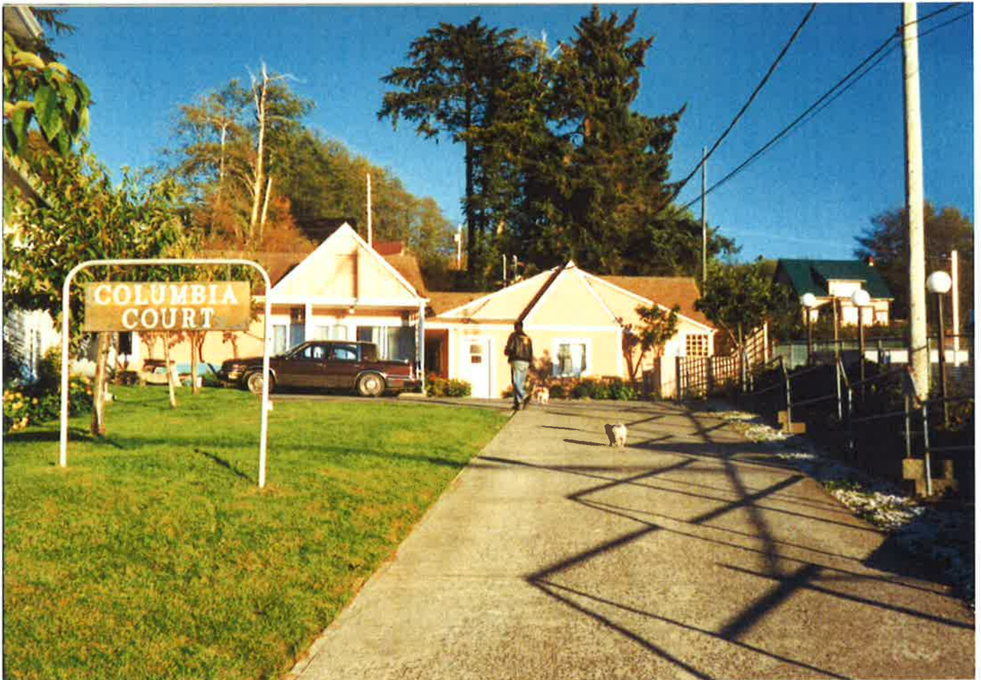
This is the Columbia Court which is our Senior Citizens Housing Complex.