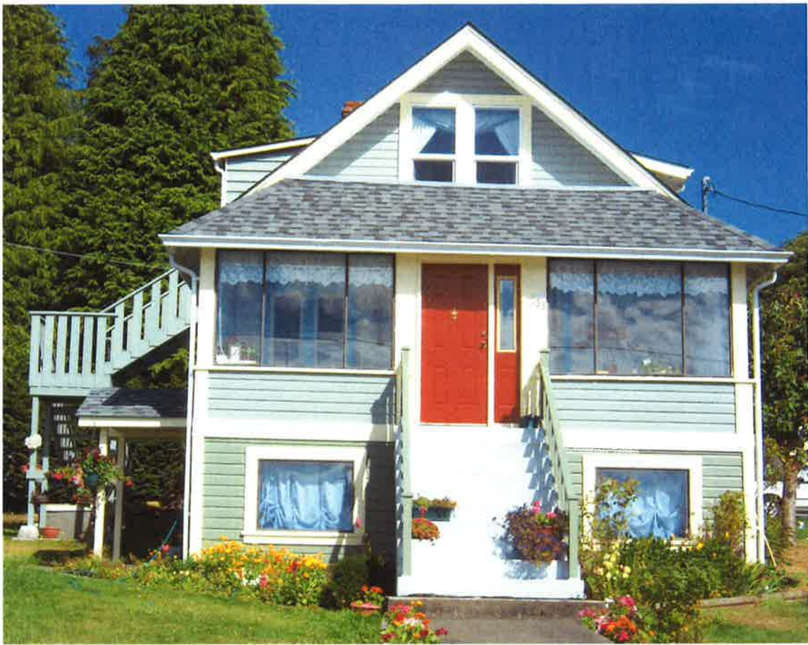
This was the old Forestry House then it became the Receiving Home. It is now privately owned residence.