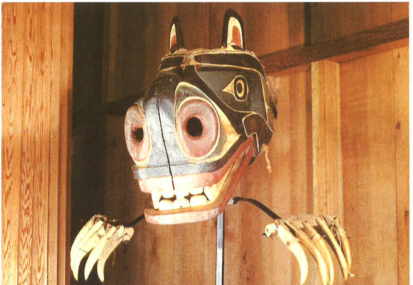
These and other postcards are available at the U'mista Gift shop.