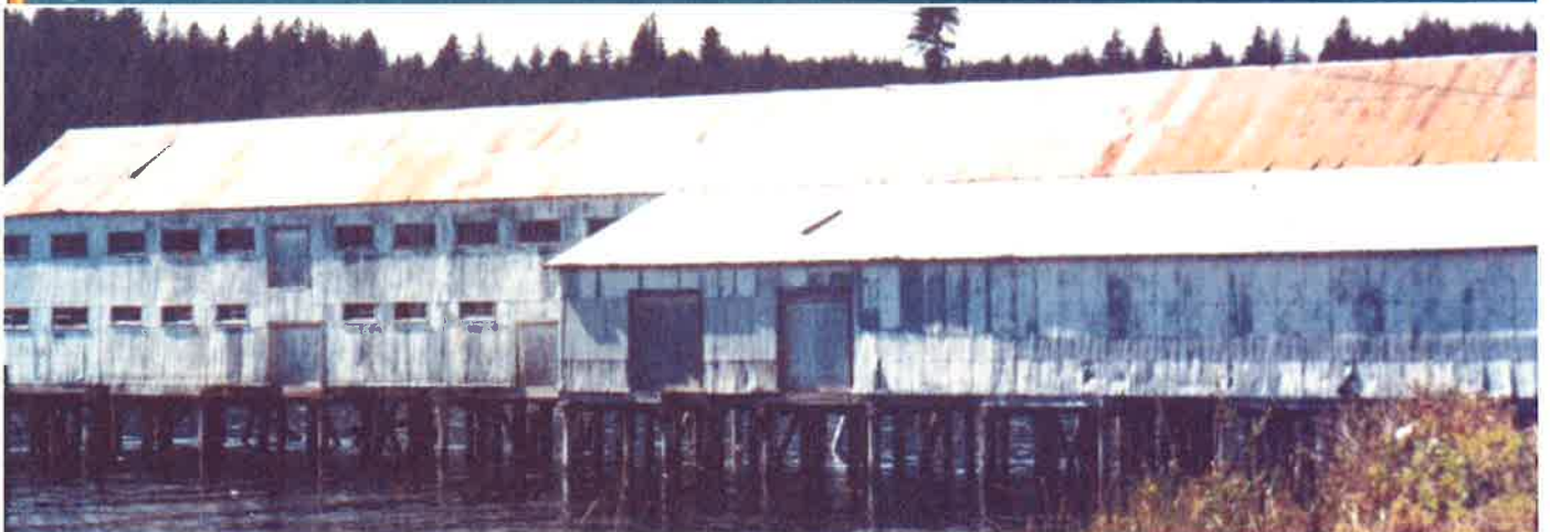
This was the Old ABC building dated to c. 1949 which was formerly a company store for the net loft owned by the Anglo British Columbia Packing Company. Adjacent to the store were residences for the company's employees. It is now owned by the 'Namgis First Nation and used as a net loft by their band members.