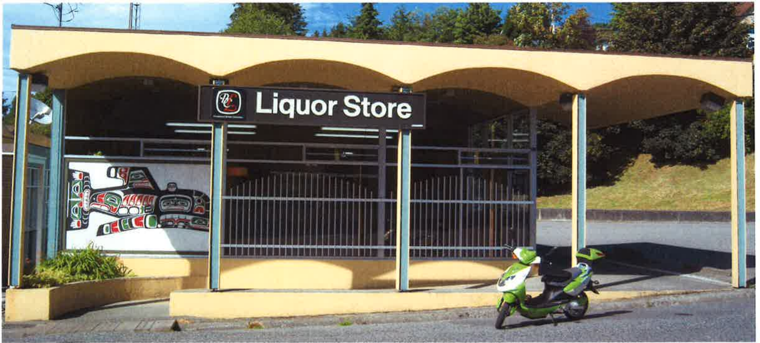
This is our Government Liquor Store. Hours: Tuesday-Saturday 10:30-6:00 PM.