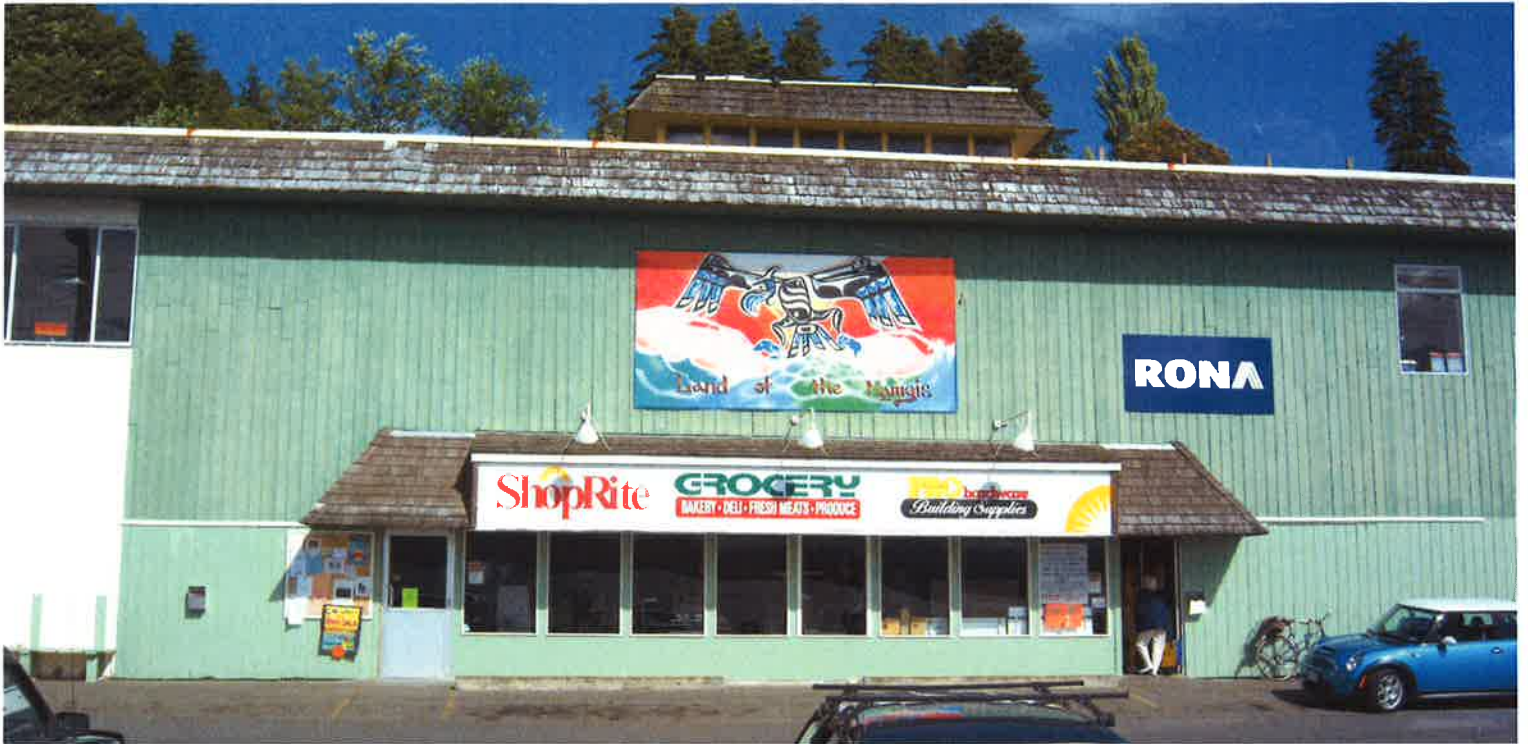
This building started out as Shop Rite then it was Island Centre, now it is Shop Rite Stores once again. Also located in Shop Rite is RONA and Deli Department.