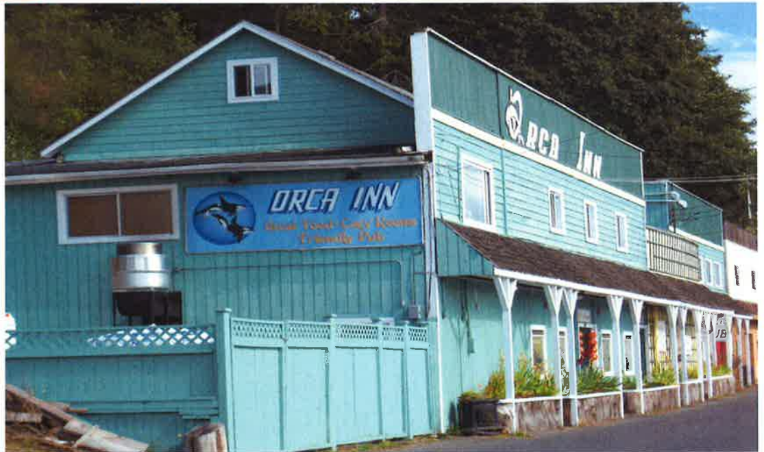
This is the Orca Inn. Part of the building use to be the old Royal Cafe and Bing Toy now it is a Hotel-Restaurant-Pub and Cold Beer & Wine Store all closed at this time.