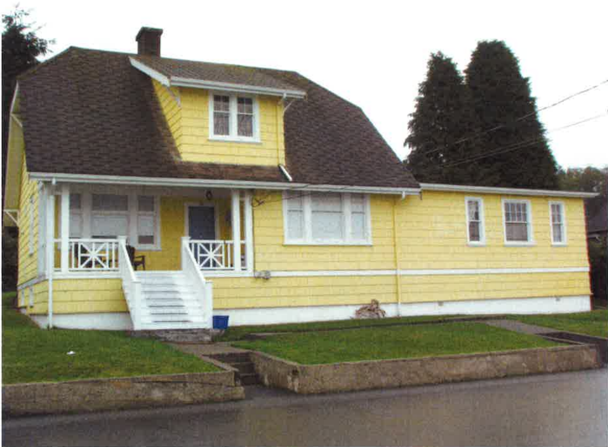
This was British Columbia Provincial Police Lock-up (ex RCMP Building), then the Court House. Now it is a privately owned residence.