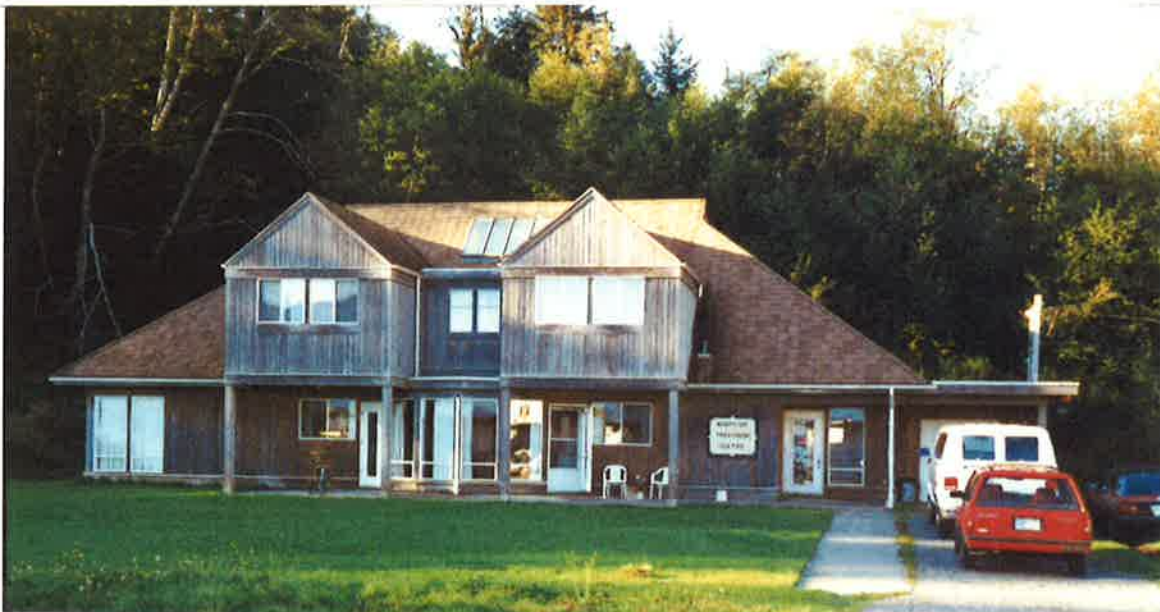
The 'Namgis Treatment Centre is a Drug and /or Alcohol Treatment Centre.