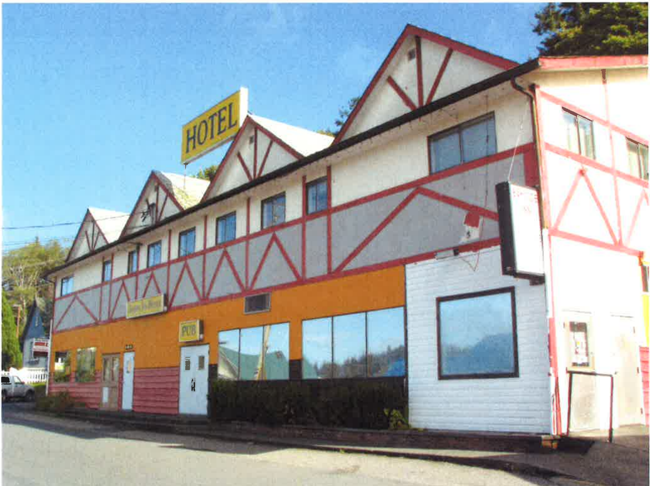
The Bayside Inn Hotel previously named Harbour Inn, unfortunately burned to the ground August 27, 1988. It was rebuilt and reopened again in May 1989. Hotel, Bayside Grill Cafe, Cold Beer & Wine 24H ATM.