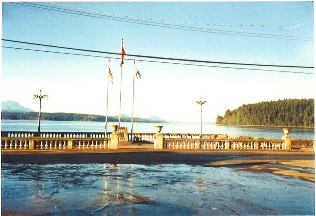
The Gilbert Popovich Memorial Town Square was started in 1987. It is a place where locals and visitors can sit and relax while looking out at the ocean. Also view Memorial Fountain for Gilbert Popovich former long time Mayor of the Village of Alert Bay.