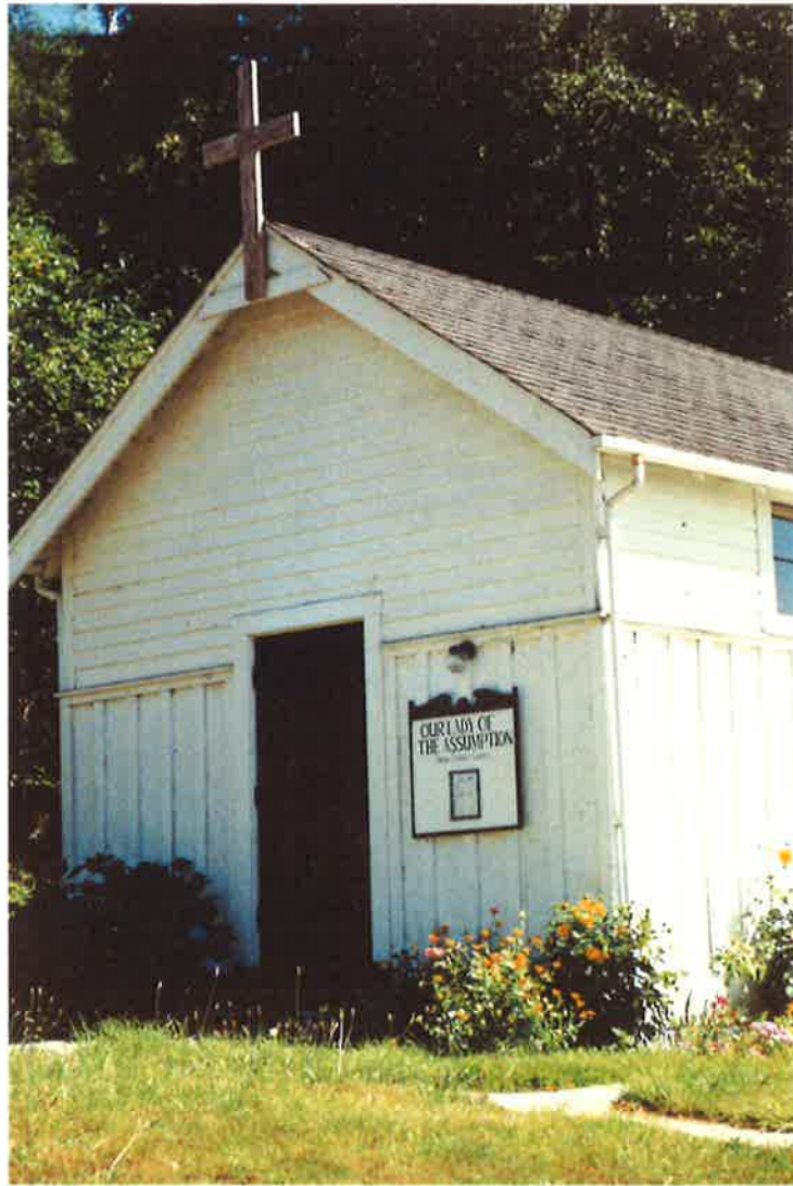
Our Roman Catholic Church had its first service on Easter Sunday, April 25, 1943. Today Alert Bay has many active Catholic members. It is also called our Lady of the Assumption Catholic Church.