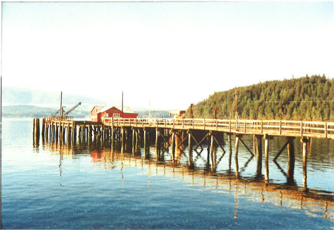
This was at first an oil dock, then it became the Canadian Fishing Co. Office, then the fishermen use the dock to mend their nets. It is still owned by Canadian Fishing Co.