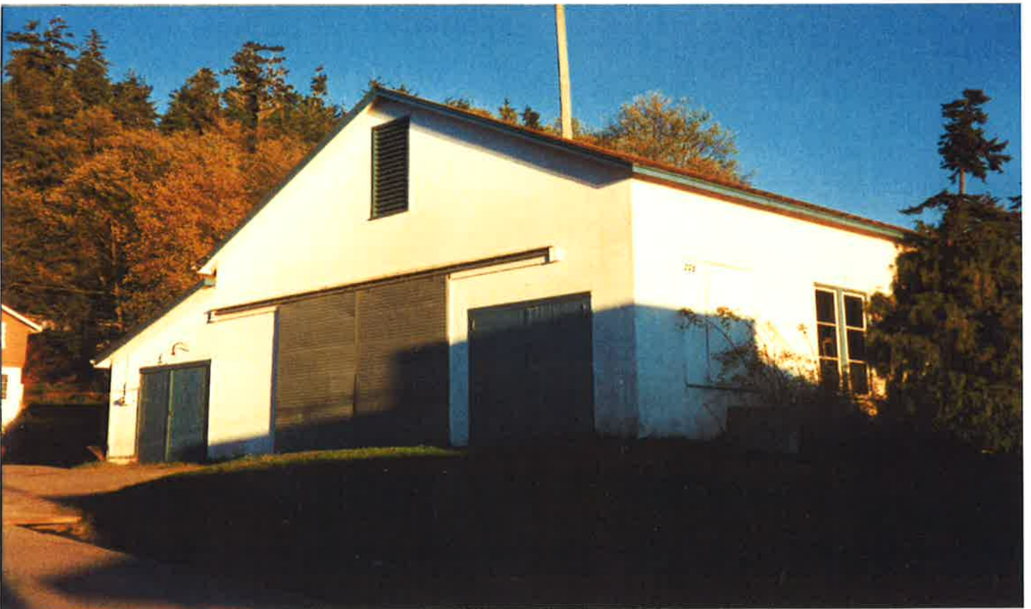
This used to be a Power House, then it was owned by BC Hydro, then the Village of Alert Bay rented the space from them for our Public Works department. It is now closed but still owned by BC Hydro.