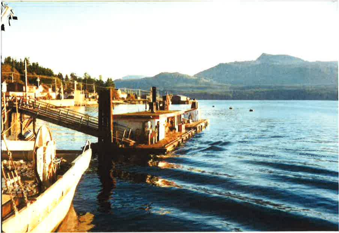
This is Cormorant Island Petroleum was owned by Gilbert Popovich. It is taken down 2005.