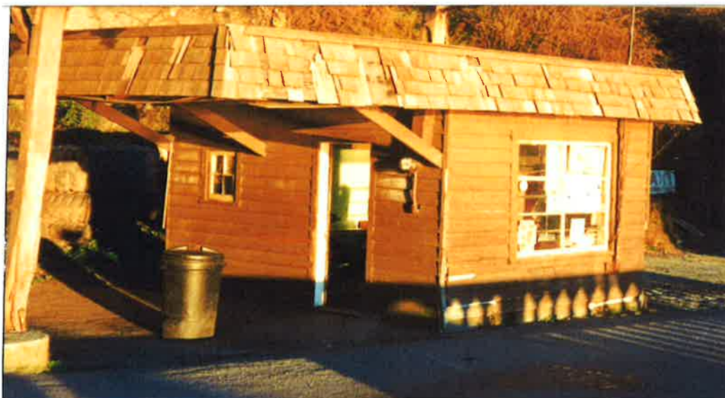
This use to be the Forty-K Taxi Stand. It is the oldest taxi company in Alert Bay. It has been in business since the early 1940's. The business now moved to a different location. Building has been taken down.