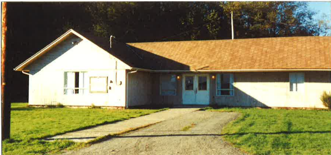
The Maya'anł is where the Elders gather during the week to talk and do various activities.