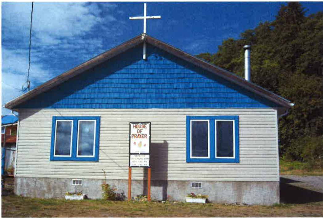
This was the House of Prayer also known as the Alert Bay Revival Centre.