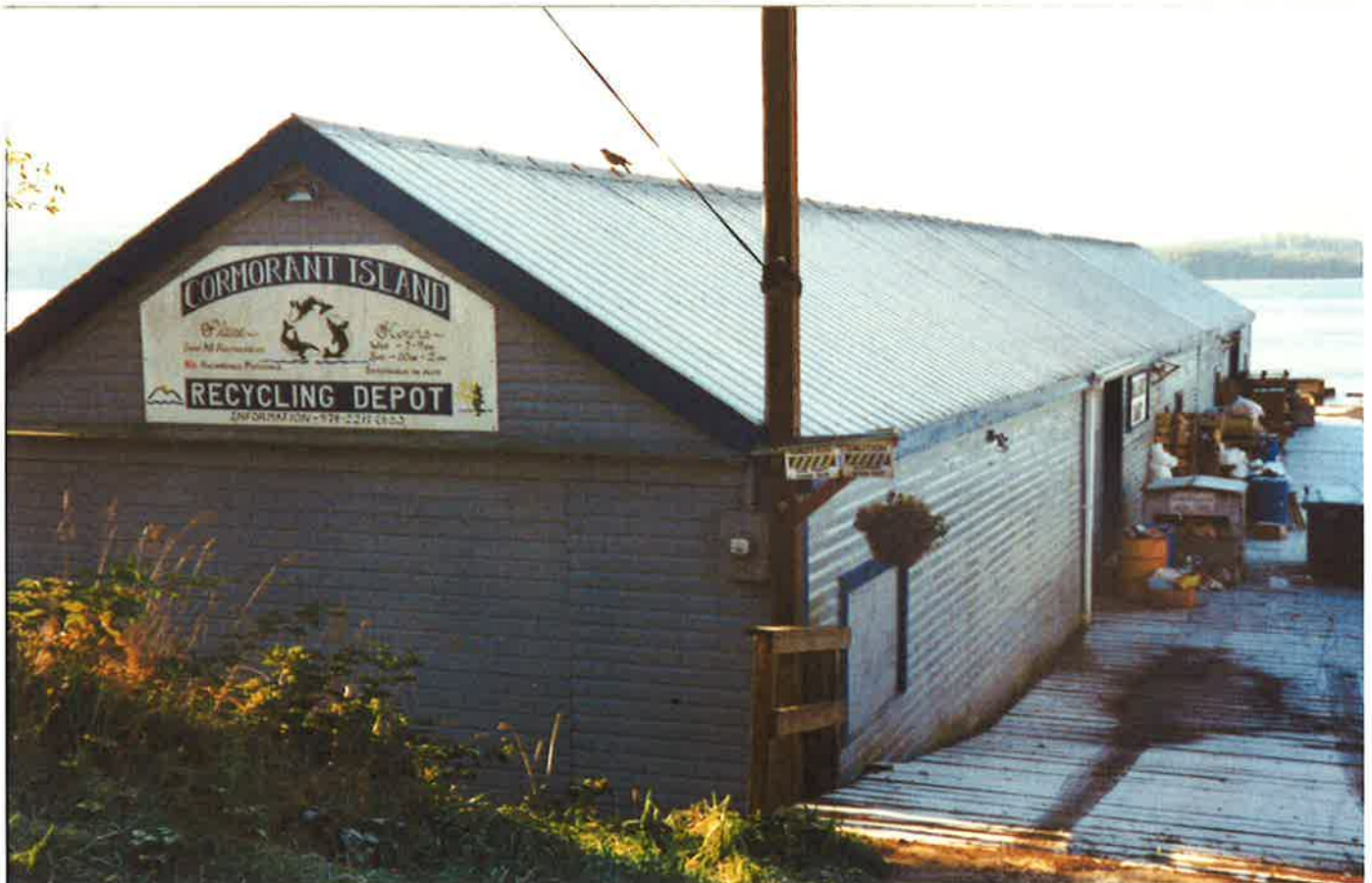
This building was the Cormorant Island Recycling Centre, before that it was the Alert Bay Pile Driving Company. The Recycling Centre has since moved to a different location. The building is now privately owned.