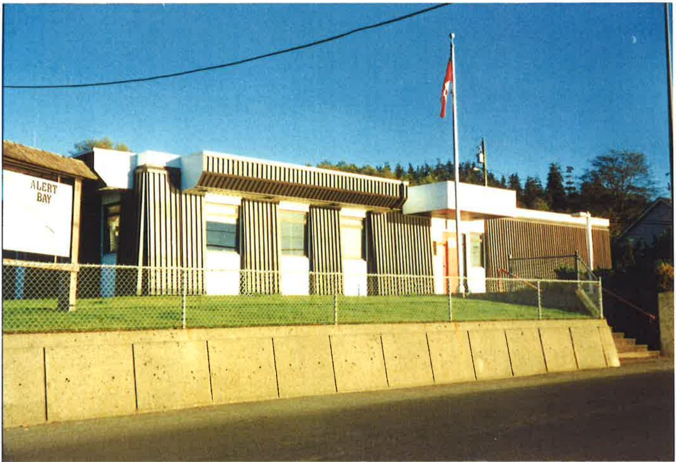
This is our RCMP Station. We have five RCMP officers stationed in Alert Bay.