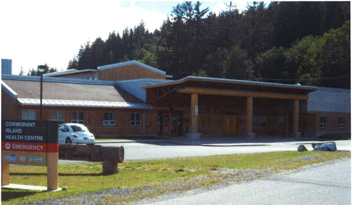
Our Cormorant Island Community Health Centre (Hospital). The move from the St. George's Hospital to the new building was made in March 2002.