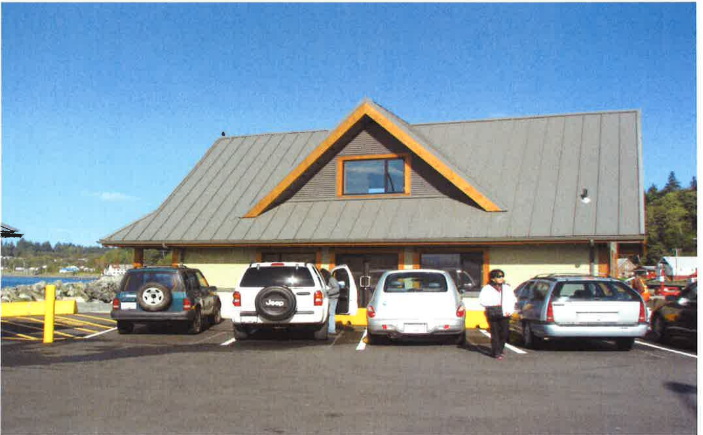
Marine Visitor Centre, Boat Harbour Office opened in 2011.