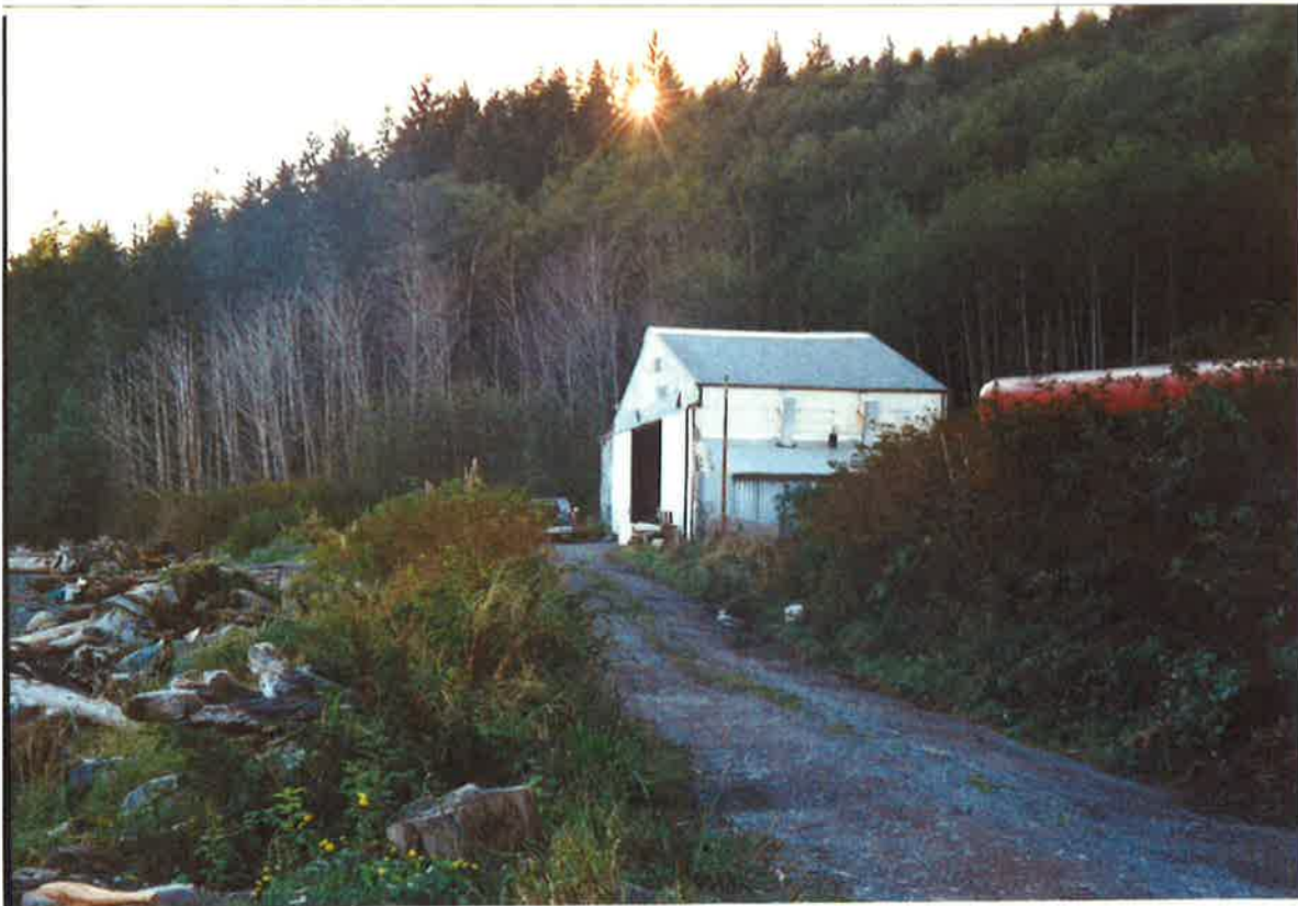
This white building is the old Airplane Hangar and was once the Salmon Enhancement Building. It is now owned by Stan Hunt. Also near here was the late Jimmy Seaweed's saw mill.