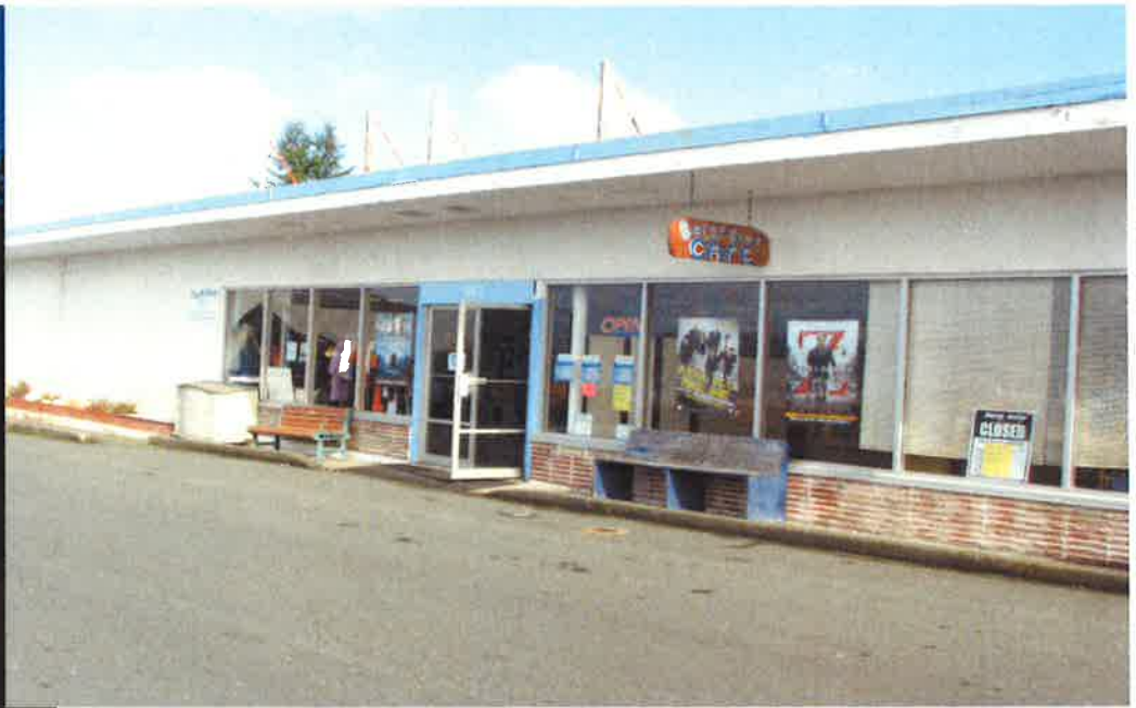
This is the BlueLine Super Market. This was one of the grocery stores we had on our Island. Now Cormorant Community Health Centre Thrift Store, The Showroom Project-Movies, Art & More....