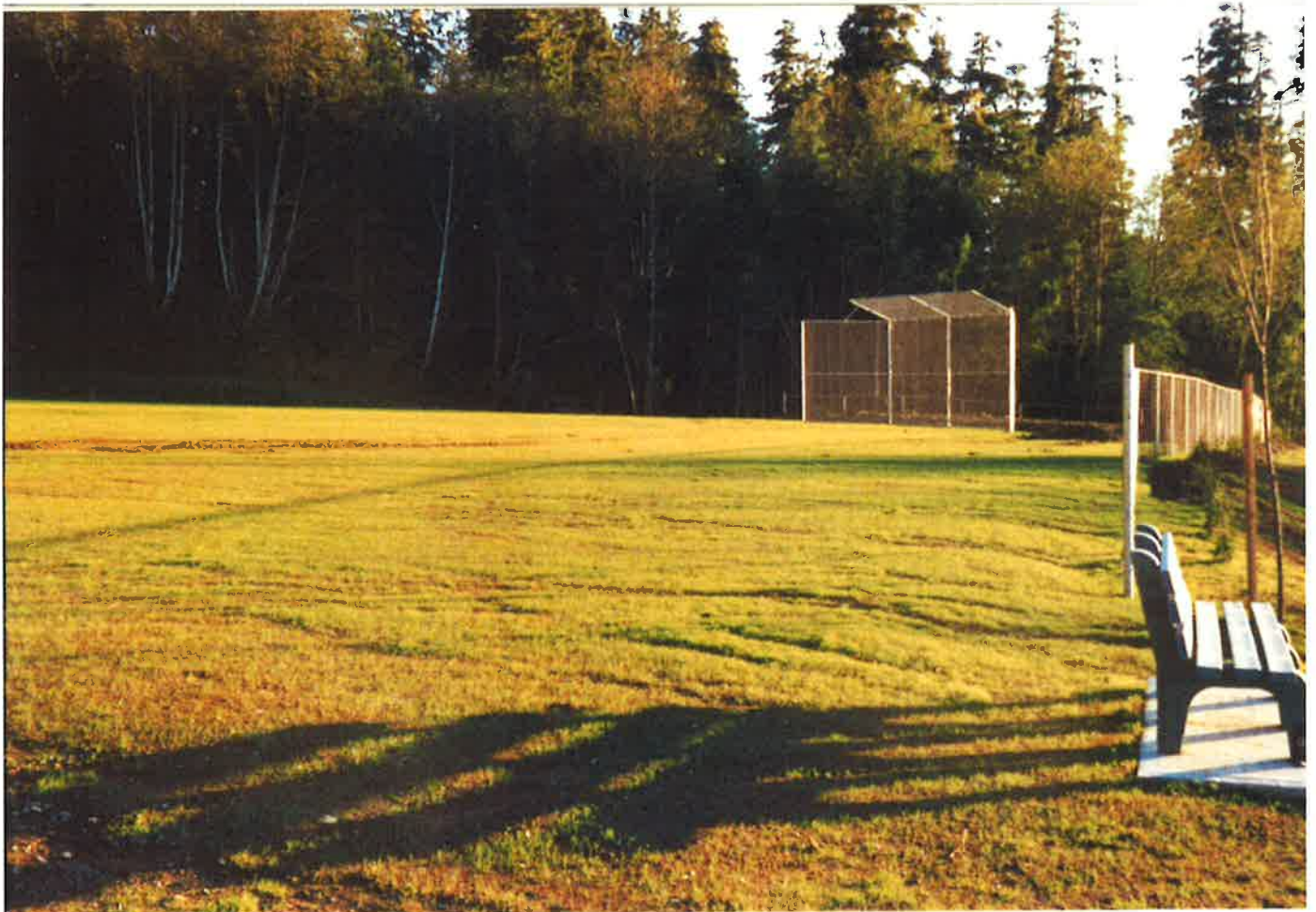
We also have a baseball diamond in the same area. Its grand opening was on July 1, 1996. Also at this location is the Annual Music Fest that ends Seafest weekend off.