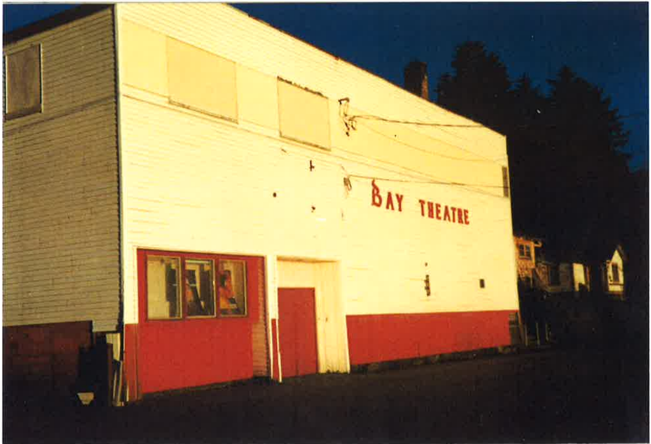
This is the Bay Theatre it was built in 1951. It was taken down November 2003. Lot is privately owned and was rebuilt as a residence.