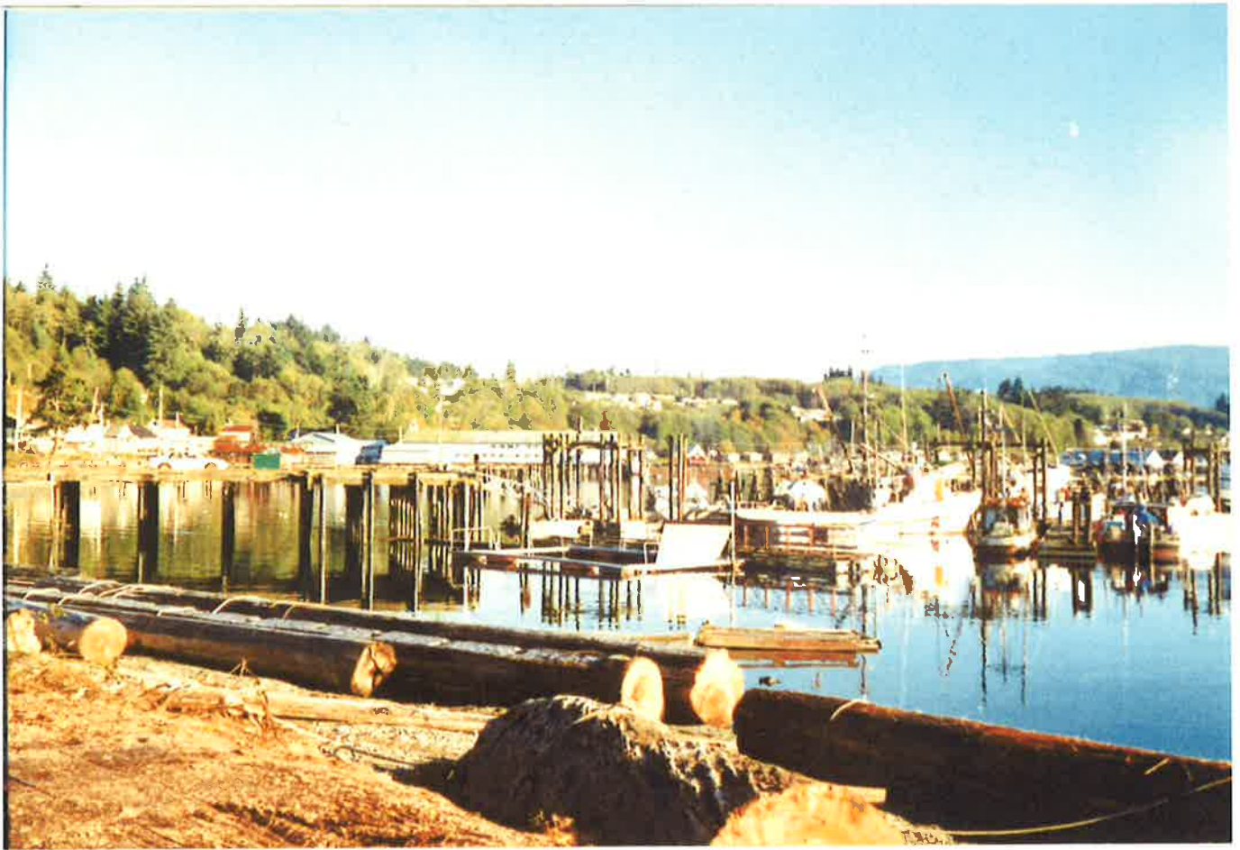
This is the 'Namgis First Nation's Breakwater. It is also known as the "old breakwater" some of our band members use this as a place to dock their boats as well as mend their nets.