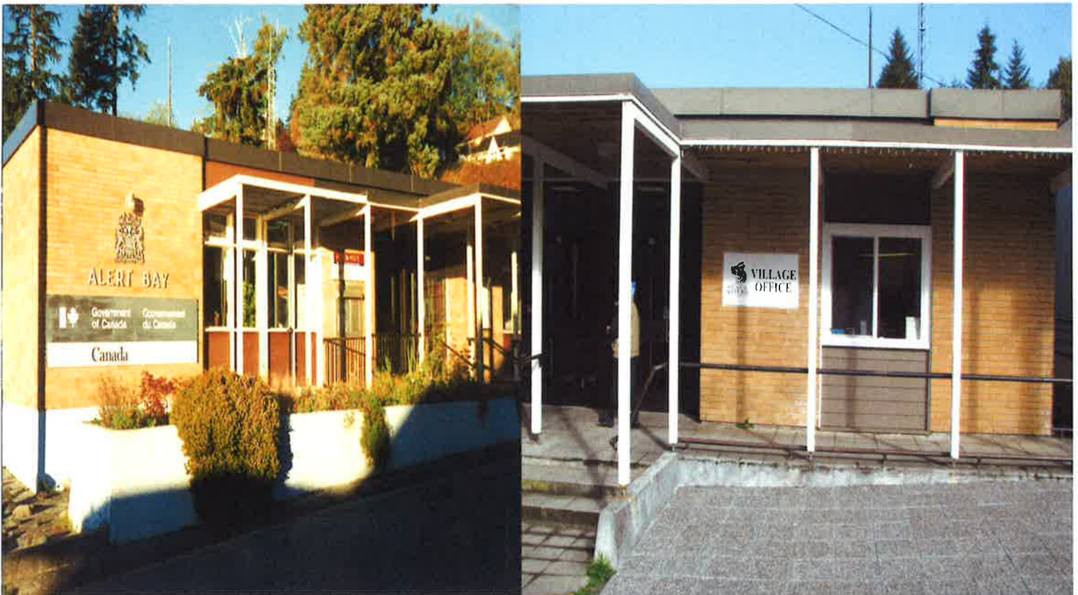
On the right is the Village of Alert Bay Municipal Office. Open Monday-Friday, 9:00 AM-5:00 PM. They offer a number of services: ICBC Auto and Driver Licensing 12 PM-4 PM , Photocopying and Faxing, etc. Also located in this building on the left is Canada Post Office. Its Hours are Monday-Friday 8:30-5:00 PM.