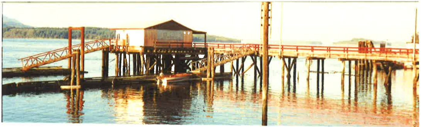
This use to be the old Shell Gulf Oil Dock it is now Hooked on Seafood, where you can buy fresh and frozen seafood, it is owned by Fred Jolliffe Jr it is now closed. This is now privately owned.