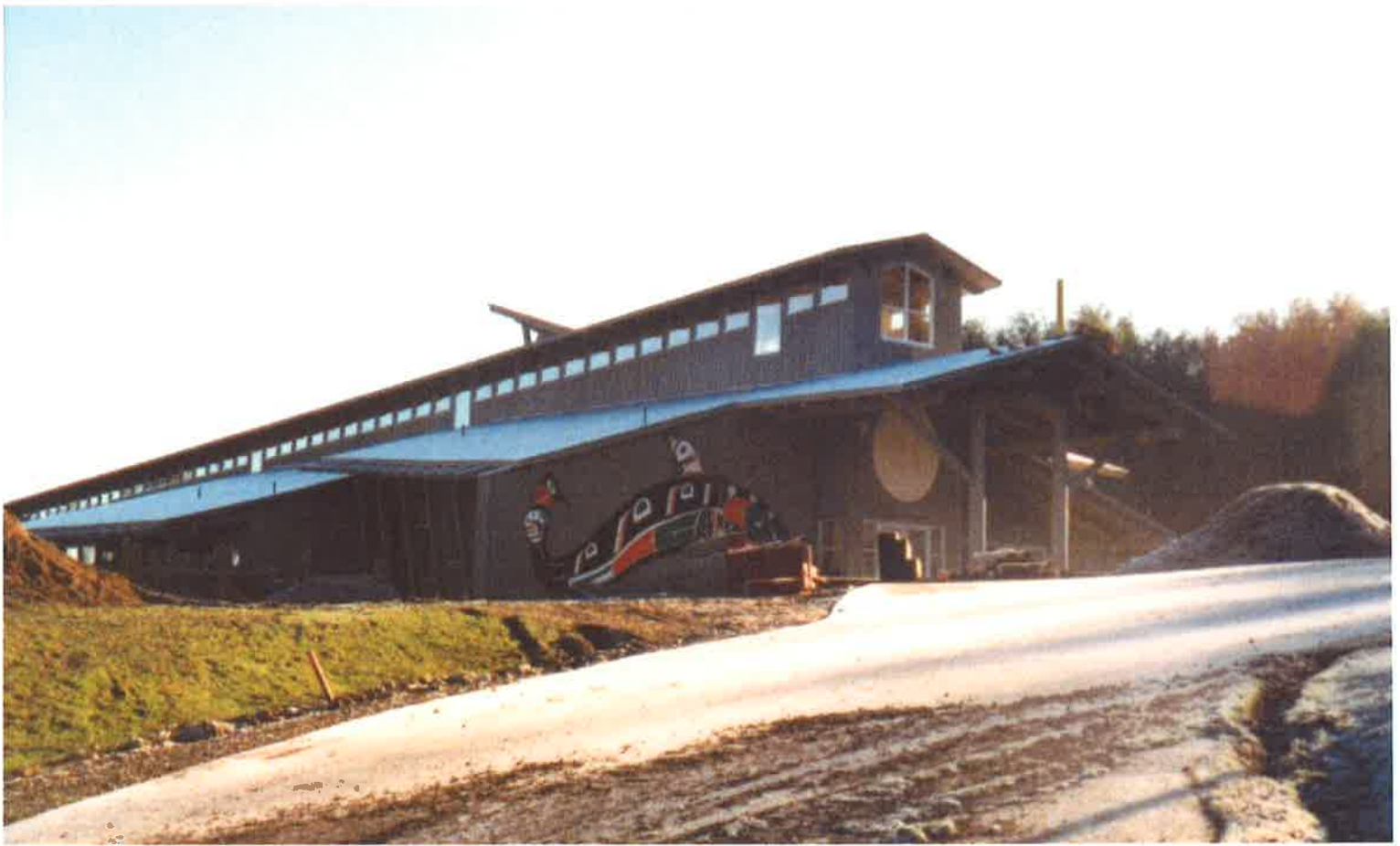
The T'hisalagi'lakw School is owned and operated by the 'Namgis First Nation and categorized as an independent School. The School opened in this new location January 3, 1996. It goes from Nursery school up to grade 7.