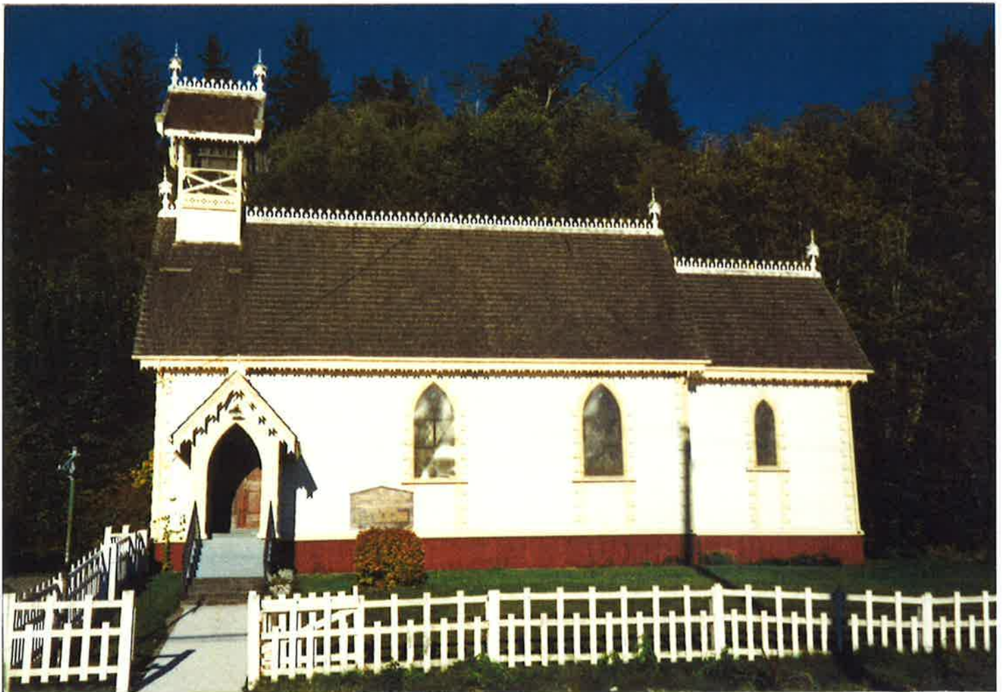
This is the Christ-Anglican Church est. 1892. Its first service was held on Christmas Day of 1892. The service was conducted in both English and in Kwakwala.