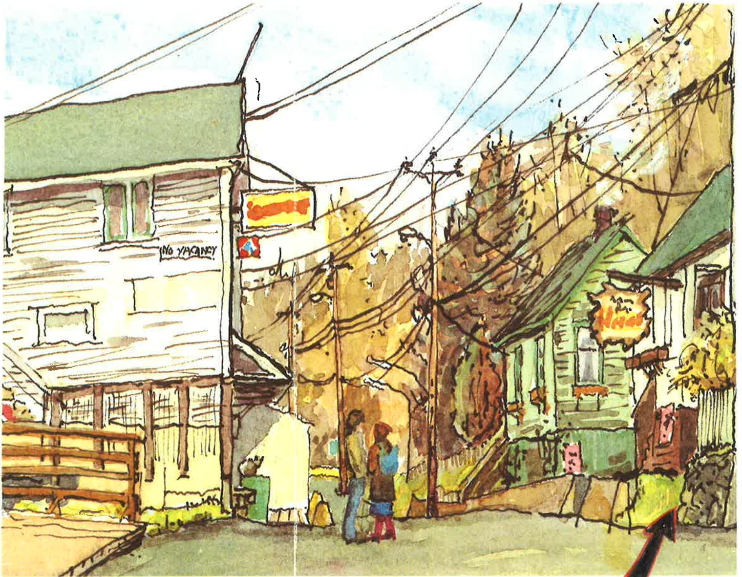
by C.M. Nancarrow 1985